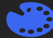
Image and text on the top of a page. Text usually displays course name and title and image represents course topic.