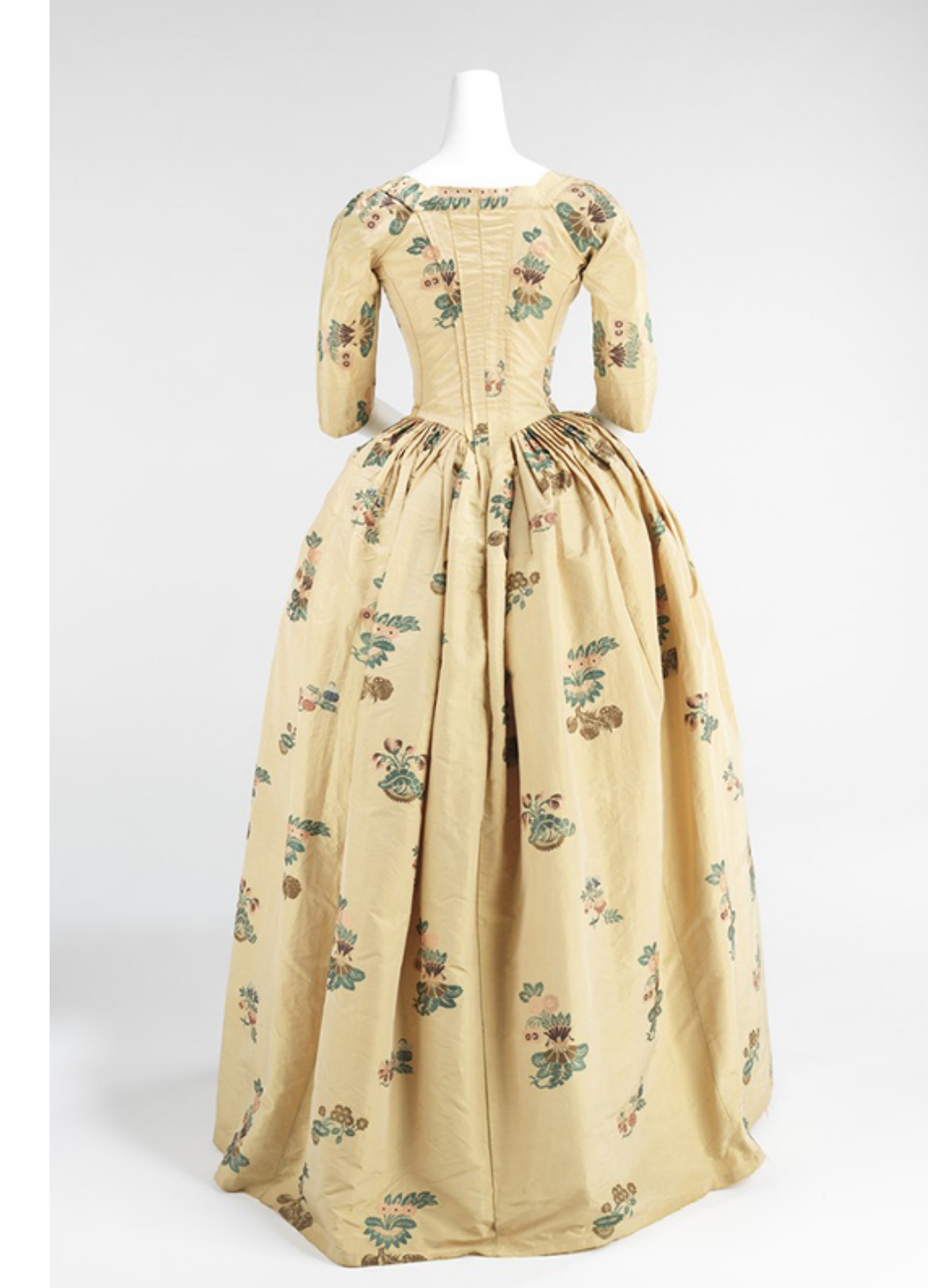
nage © The Metropolitan Museum of Art

You have designed this costume for a production of Tartuffe.